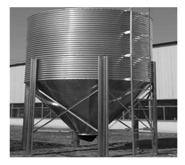
Fig. 1. The test silo

The purpose of the test: inspecting the relationship between the lateral pressure of the silo wall and the pressure of the grain silo in the grain outlet. The influence of different diameters decompression tube on the side wall of the pressure. Decompression tube of the same diameter tube with different opening rates on the effect of dynamic lateral pressure of silo. Loading wheat which bulk density 0.74-0.78 tons/m<sup>3</sup>, water content being 13%-15% in the test silo. The size and distribution of grain horizontal pressure on the wall are calibrated by the mechanical sensing elements which are arranged at the heights of 2 m, 6.5 m, 12.5 m, 18.5 m. The test silo is depicted in Fig. 1